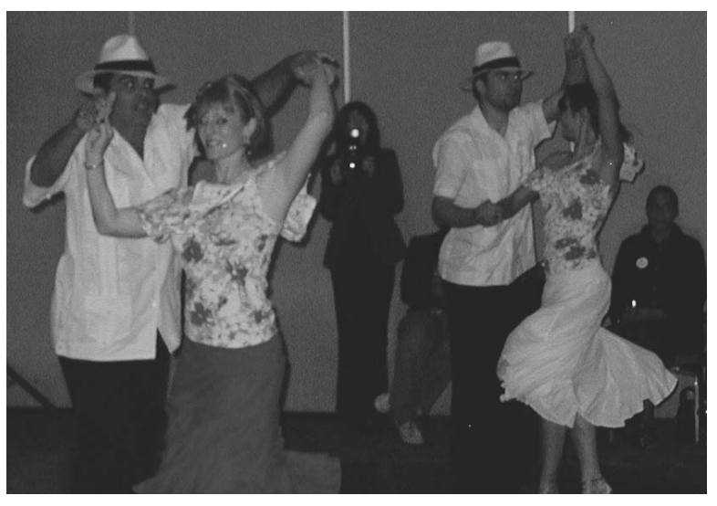
Salsa dancers start the reception